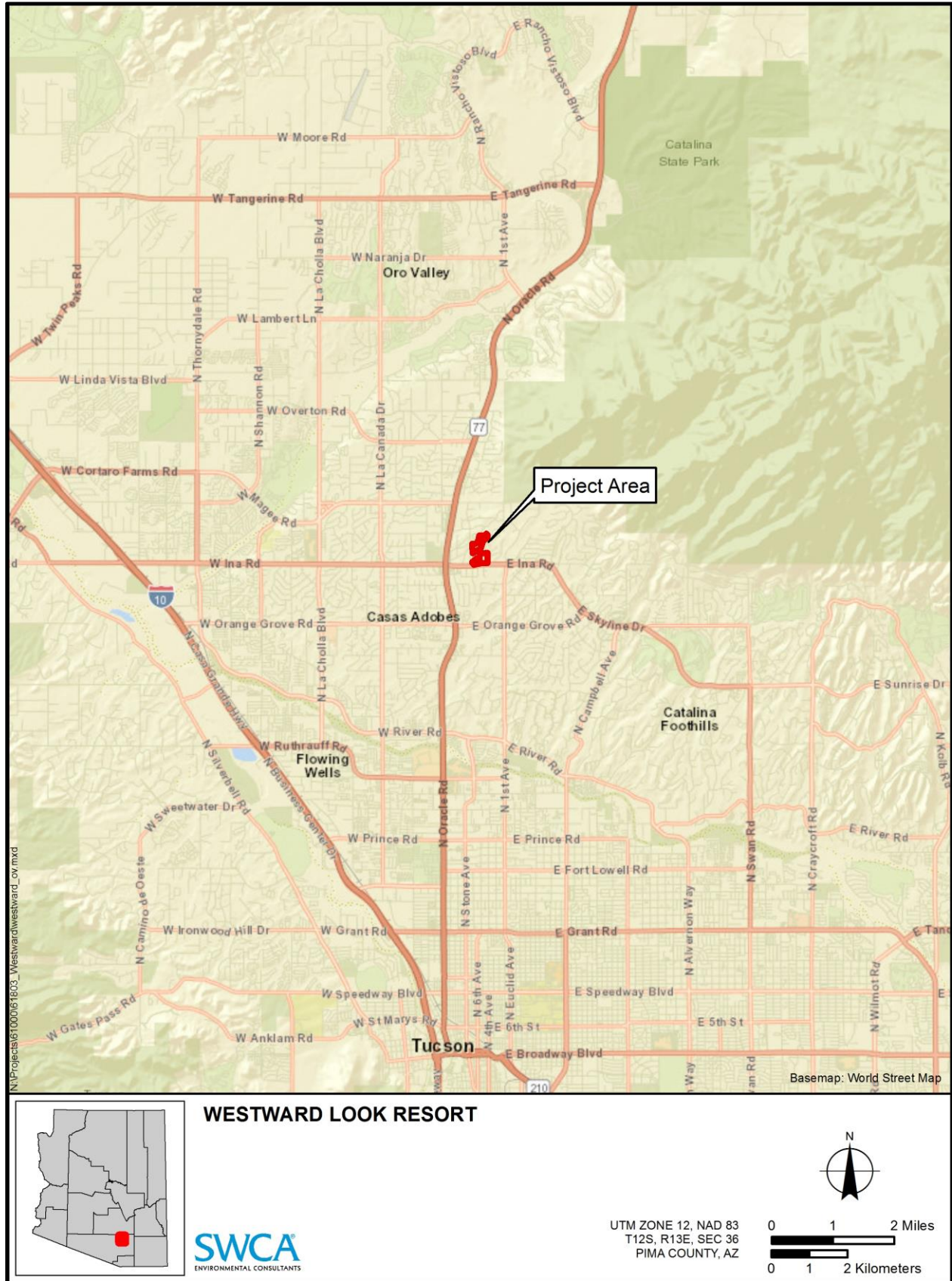
Figure 1. Project location map.