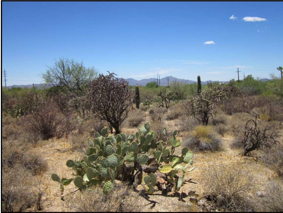
Figure 4. Overview of project area, facing west.