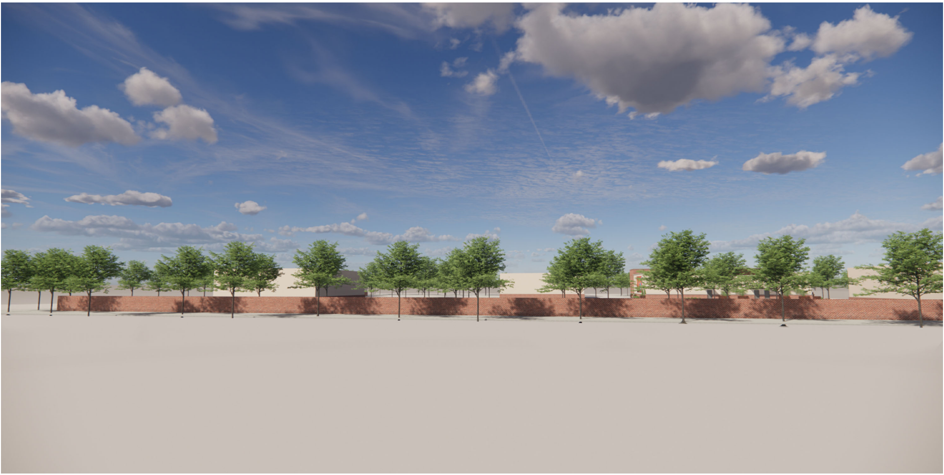
VIEW FROM POINT B