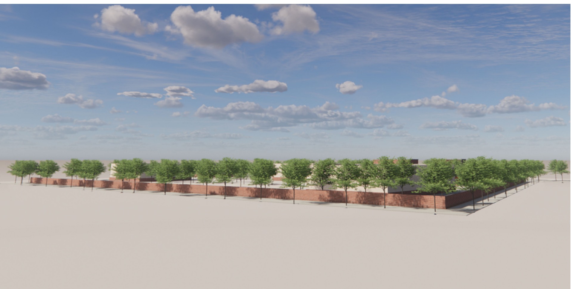
VIEW FROM POINT A