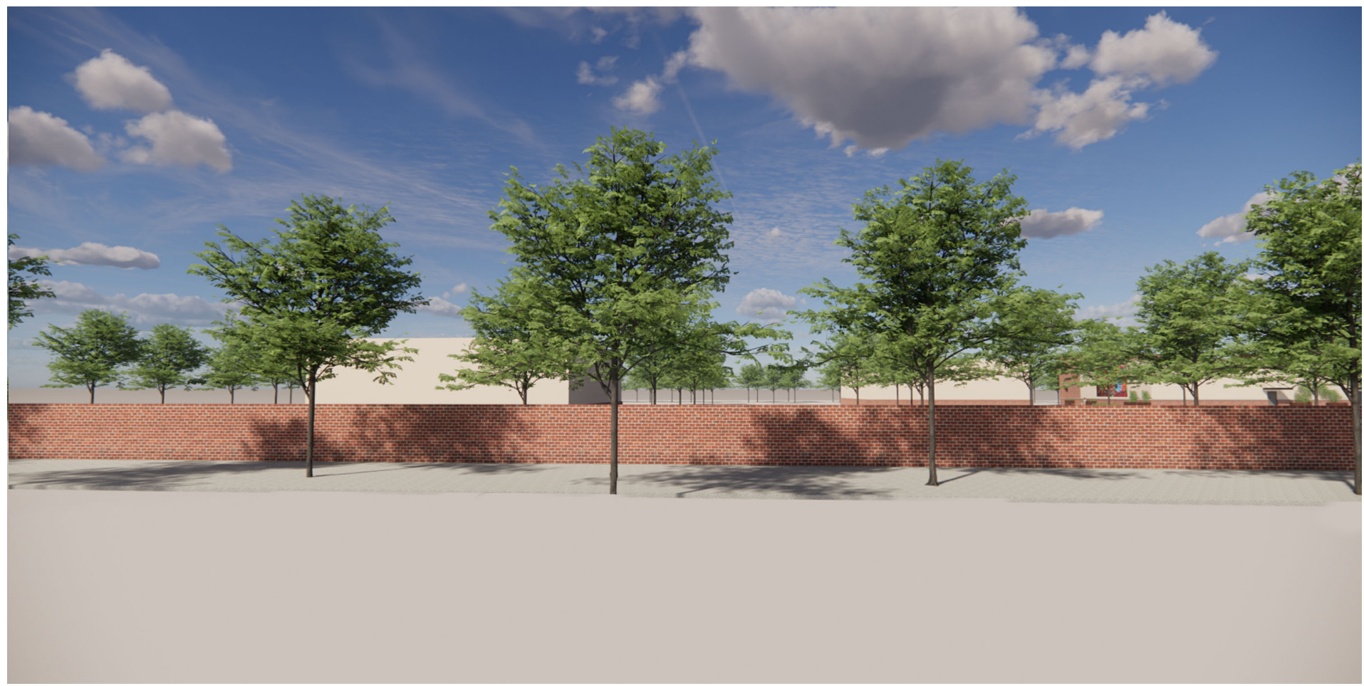
VIEW FROM POINT C

THIS DRAWING IS AN INSTRUMENT OF SERVICE & IS THE PROPERTY OF SPS+ARCHITECTS LLP & MAY NOT BE REPRODUCED OR REPRODUCTIONS HEREOF USED WITHOUT WRITTEN PERMISSION.