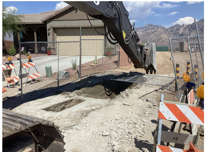
Started with excavation after finding utilities.