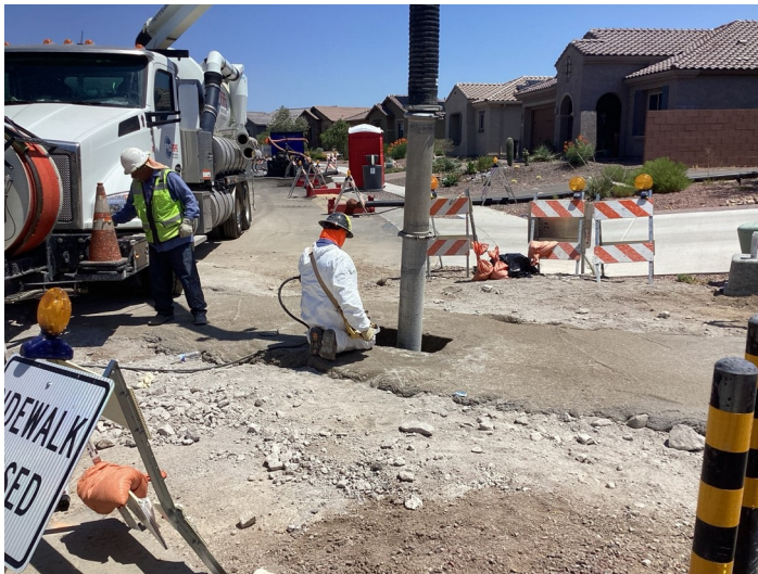
Using pump to find utilities