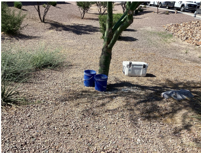
Slurry samples from 7/8/24